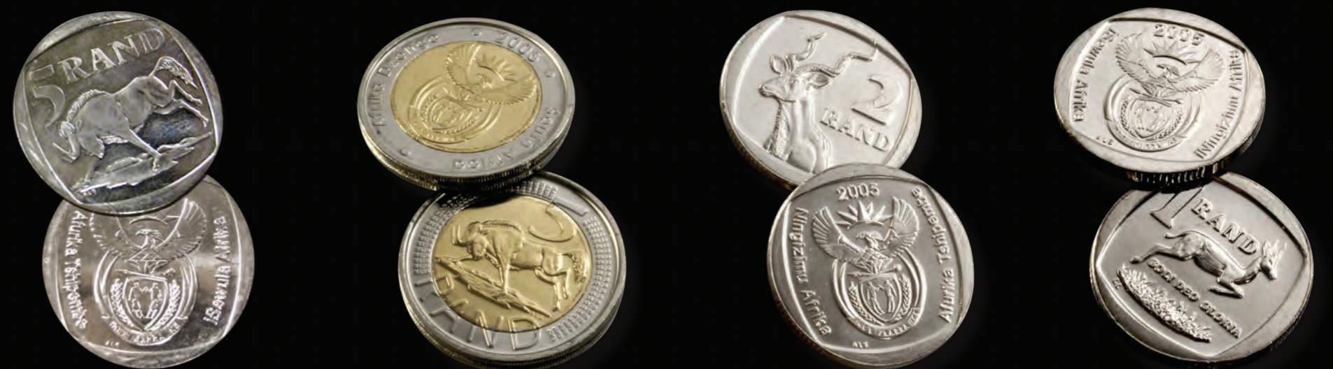
New bi-metal R5 coin

All coins produced to date remain legal tender